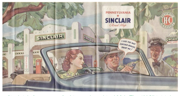
Sinclair's first super-fuel is marketed in 1926. The "HC" initials stand for "Houston Concentrate," but some advertising men prefer the term "High Compression."

In its first 14 months, Sinclair's New York-based company produces six million barrels of oil for a net income of almost $9 million.