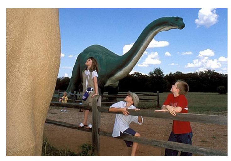
Sinclair's historic 70-foot Apatosaurus and a 45-foot Tyrannosaurus Rex today are preserved at Dinosaur Valley State Park, 50 miles southwest of Fort Worth, Texas.

Glen Rose, Texas, about 50 miles southwest of Fort Worth. He can still be seen there today. The Texas park contains some of the best preserved dinosaur tracks in the world.