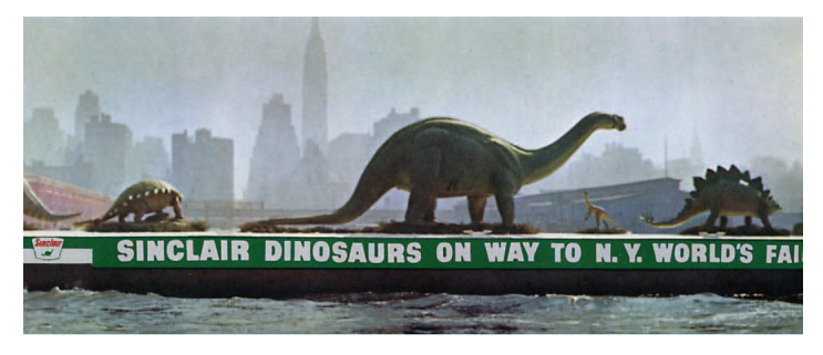
Spectators in 1964 were amazed to see a barge of dinosaurs on the Hudson River.

By the end of the World's Fair, about 50 million visitors had marvelled at Sinclair's "Dinoland" exhibit." and "Visitors will attend the 1964-1965 New York World's Fair - with the Sinclair Corporation's "Dinoland" exhibition among the most popular of all.