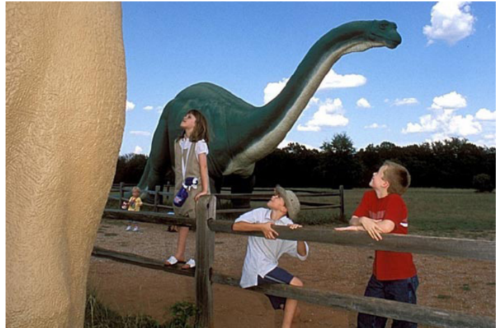
Sinclair’s historic 70-foot Apatosaurus and a 45-foot Tyrannosaurus Rex today are preserved at Dinosaur Valley State Park, 50 miles southwest of Fort Worth, Texas.

Glen Rose, Texas, about 50 miles southwest of Fort Worth. He can still be seen there today. The Texas park contains some of the best preserved dinosaur tracks in the world.